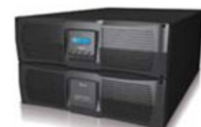
10 kVA + Battery Pack