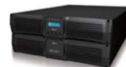
5/6 kVA + Battery Pack

All specifications are subject to change without prior notice.