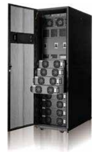
Scalable and Hot-swappable